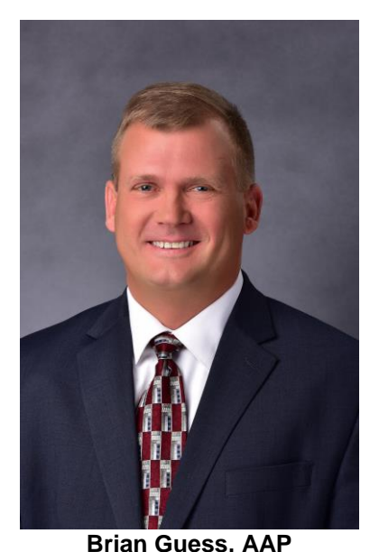
Sr. Vice President & Team Leader, Commercial Payments & Payables – KeyBank

This session will review the various Faster Payments solutions such as Zelle, Same Day ACH, Real-Time Payments and others, that are currently operating today in the United States or are forthcoming. We will dive into use cases including Person-to-Person, Business-to-Person, Business-to-Consumer and Consumer-to-Business. Plenty of time will be reserved for questions, as this topic is top-of-mind for many treasury professionals.